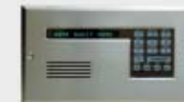
D54C – Stainless steel faceplate