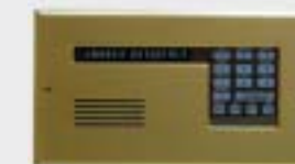
D54B – Brass faceplate