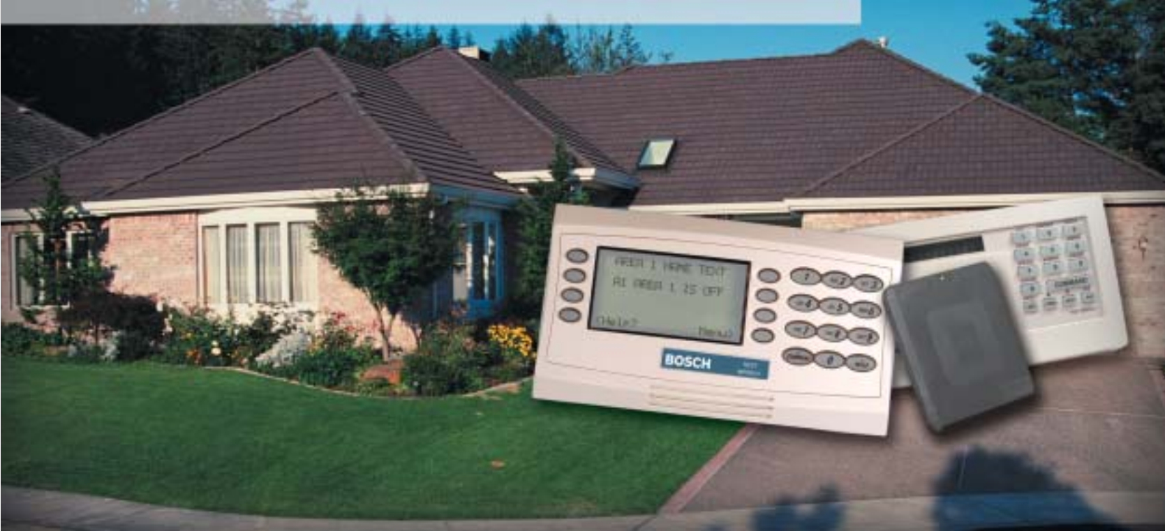
Residential application and product information